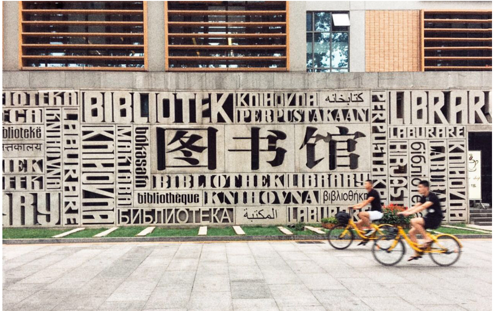
Special Selection The Babel Witnesses & New Four Great Inventions Cheng Sijin Beijing Foreign Studies University Beijing, China